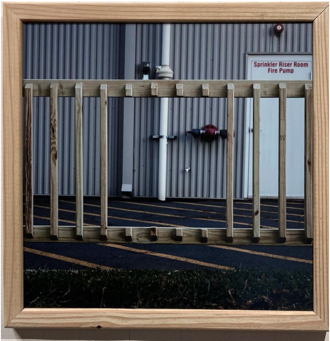
Fence Hack #5 - Issyk-Kul, Kyrgyzstan 2014 Wooden fence, photograph 38 x 38 cm