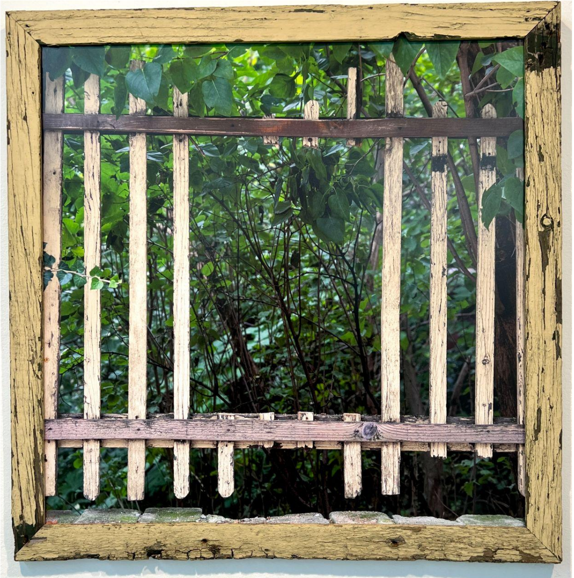
Fence Hack #13 - Sofia, Bulgaria 2022 original wooden fence, photograph 55 x 55 cm 5.500 Euro