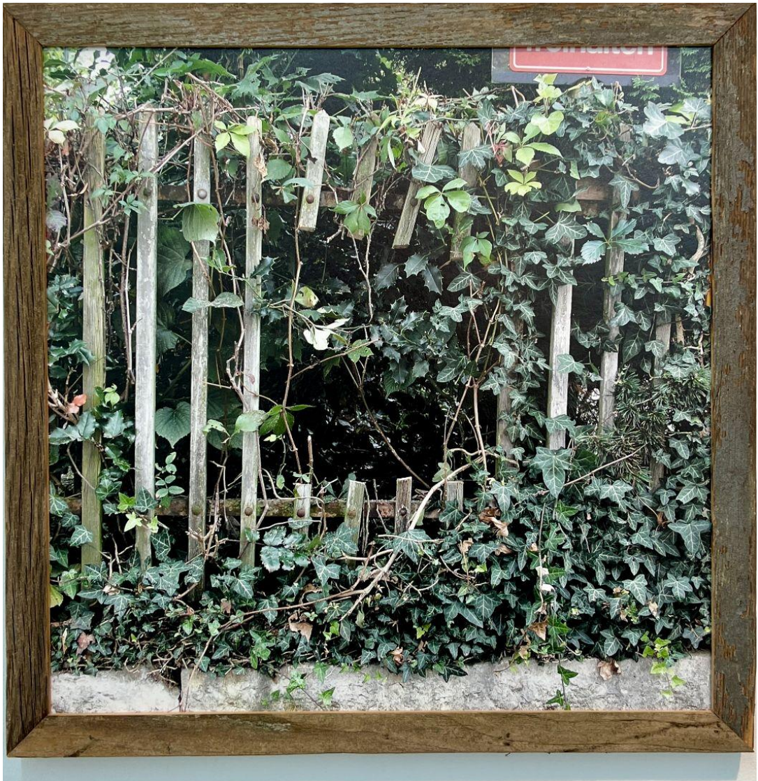
Fence Hack #2 - Zürich, Switzerland 2014 original wooden fence, photograph 43 x 43 cm 4.280 Euro